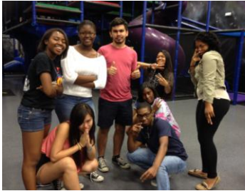
Key Club Social at Q-Zar Laser Tag!

One of our most important goals this year is to keep all members involved and enthusiastic throughout the whole year. In order to have this, we will have at least one social activity or service.